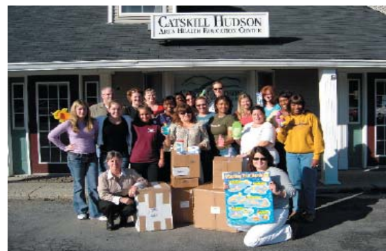
SUNY New Paltz Nursing Students with their donations in front of the Catskill Hudson AHEC office.

Some comments from students and faculty: “It is very healing to be able to do something about it and help alleviate the suffering of others.” “I was proud and honored to have been involved in this project.” “We have family in New Orleans. Thank you for all your hard work and commitment.” “It’s nice to know that we can all come together at times like these and give what we have to help.”