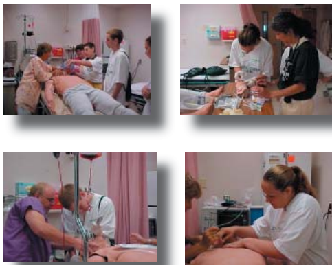
Middle-school students participate in healthcare procedures at the Delaware Valley Hospital M*A*S*H Camp

Delaware Valley Hospital (DVH) conducted their very first M*A*S*H Camp in July. This successful 2-day program involved seven (7) middle and high school students from Schoharie, Delaware, Sullivan and Otsego counties. DVH department managers were so enthusiastic about the M*A*S*H camp that 22 departments participated in the program. As a result, 100% of the camp participants stated that they were now considering a healthcare career. Ten percent stated that they would consider working at DVH in the future and many of the students wanted a follow-up experience, such as shadowing.